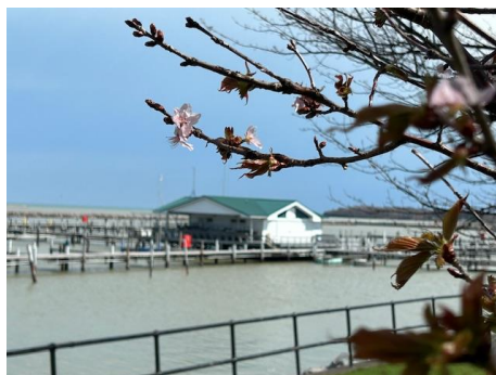
Spring has sprung around the DYC!