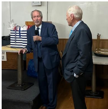
Past and Future Commodores helping mc at the banquet!