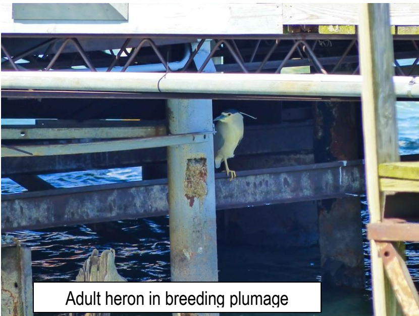
Adult heron in breeding plumage

Many have seen cars and people by DYC with cameras focusing on the Clubhouse. It is reported that Black-crowned Night Herons have been overwintering at the Clubhouse. The Lake Erie Bird Club has been very excited about it and are making regular reports to Cornell's Ornithology eBird database. One is an adult in breeding plumage and they may be building a nest under the clubhouse.