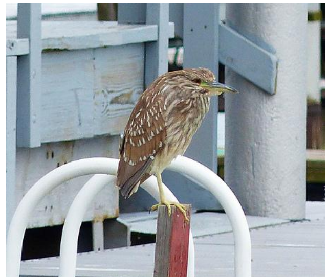
Immature black crowned heron