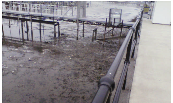
Dec. 27, 2012..record low water. Top is gate to NYC and below Wright Park Beach.