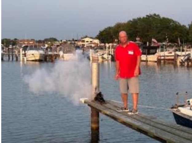
Commodore's party fun!!