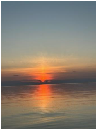
Sunset pictures from the boat are the best!!

If anything wants DYC merchandise (stickers, hats etc. from the trophy case) make sure to let Brett or Jenn know.