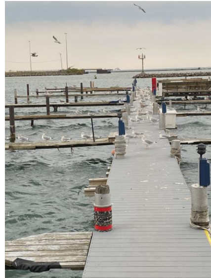
Seagulls taking over the yacht club now that boats are gone!