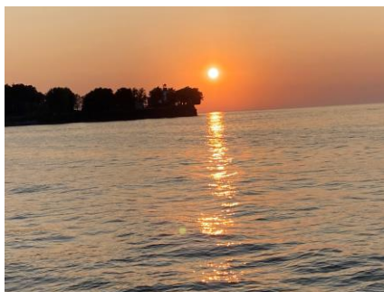
California wildfires affected our sunsets last month. It looked like the sun was filtered. Hope you got to see it!