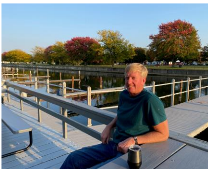
Our Commodore enjoying one of the last happy hours for the season.