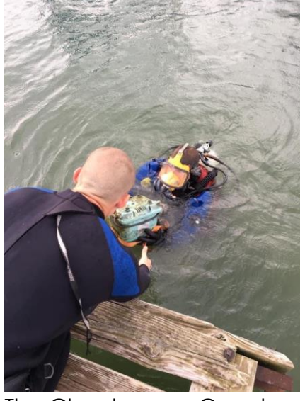
The Chautauqua County Sherriff's Department Dive Team rescuing one of our bubblers.