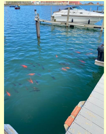
Pretty, colorful carp were spawning at our club last month.