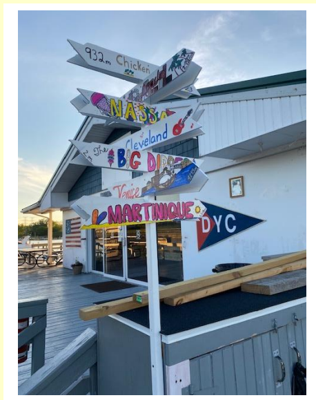
My daughter, Mia Piede, spent hours upgrading our new nautical directional sign. It is for aesthetical purposes only and not accurate for directions...although the miles are correct!