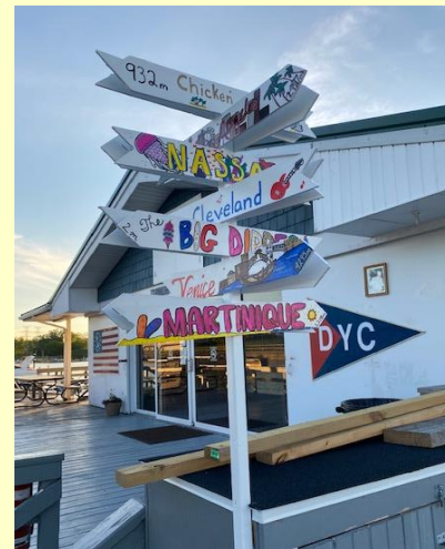
A picture of our new sign, not to be used for navigational purposes!