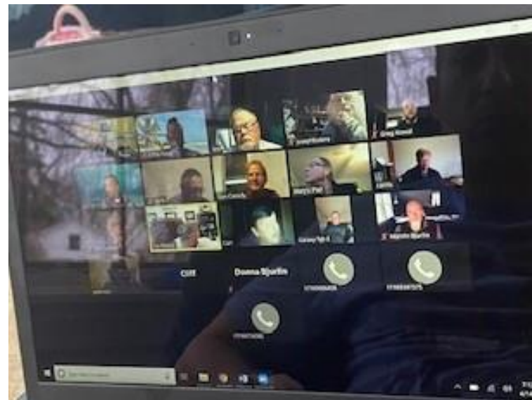
Here is a picture of my computer from our virtual “Zoom” meeting for April. We all kept social distancing by connecting from home!